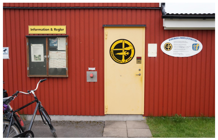
Karlskoga Club House