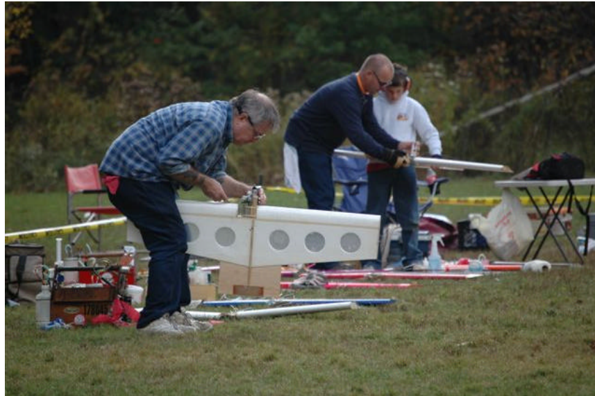
Pit Action at the Fall Finale