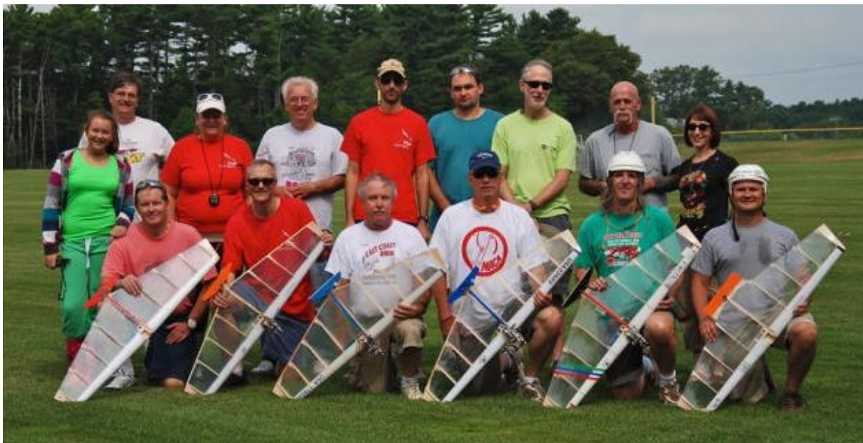
The entire crew that supported the second annual New England Cup of F2D