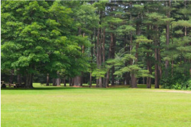
Salmon River State Forest, Green and Unspoiled