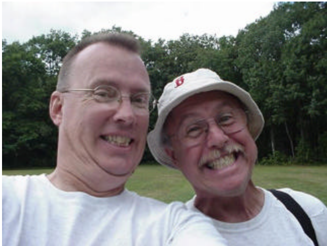
I have no words to describe this