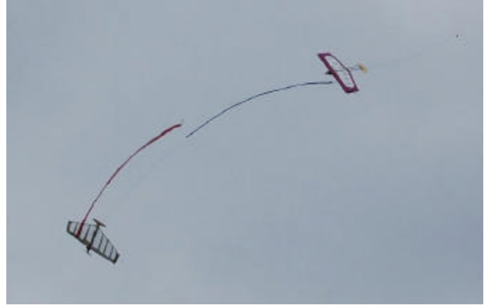
Just a nibble please