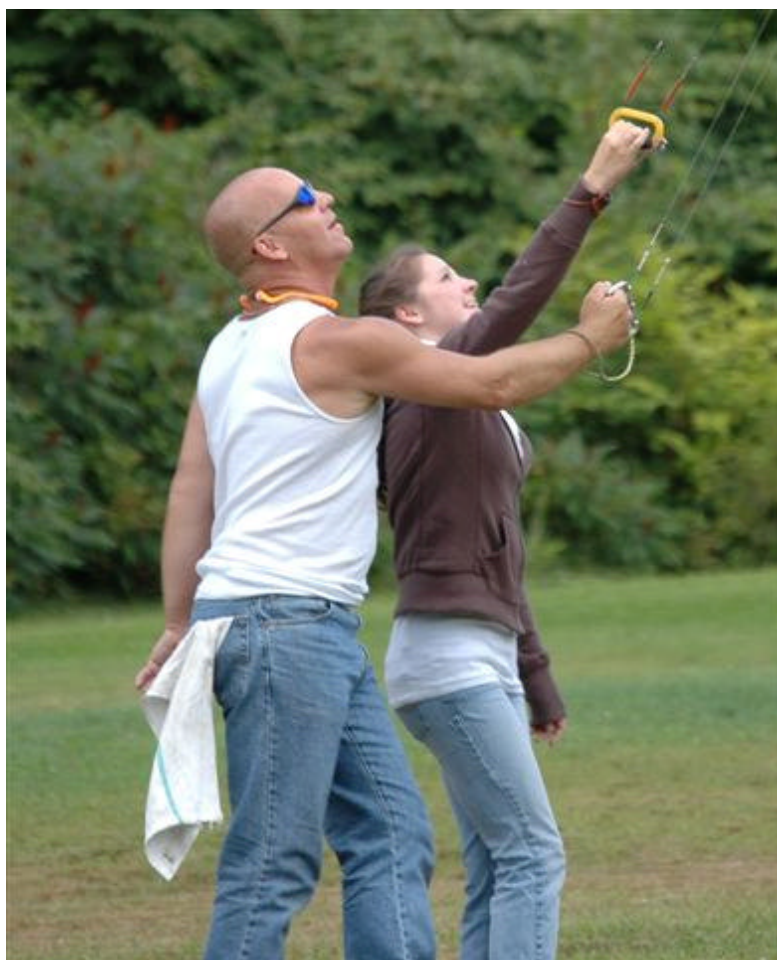
Team Vader, in action, at the Granite State Invitational