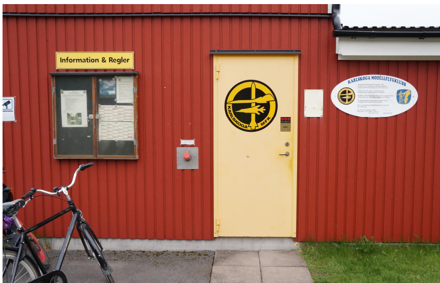
Karlskoga Club House